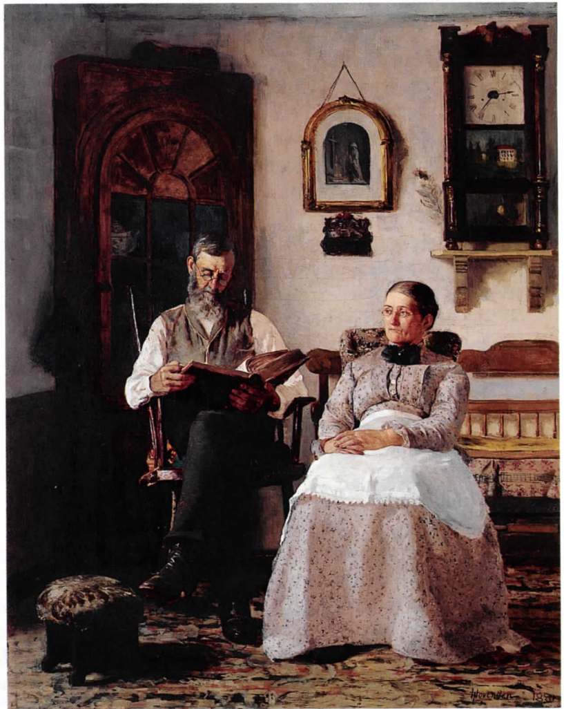
The Old Version , 1881. Thomas Hovenden. Oil on canvas, 24 x 19 in. Fine Arts Museums of San Francisco. Gift of Mr. and Mrs. John D. Rockefeller, 3rd. 1993.35.17.

It was about a week after that the old man, waking suddenly in the night, stretched out his hand and found himself alone. The room was in darkness, and the sound of subdued weeping came from the window. He raised himself in bed and listened.